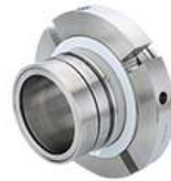
Paper & Pulp Seals