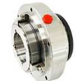
Sand Mill Seals