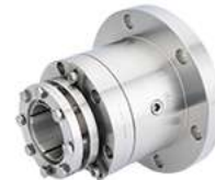
Mixer & Agitator Seals