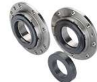
High-speed Equipment Seals