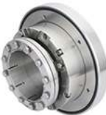
Slurry Pump & FGD Seals