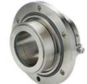
Compressor & Blower Seals