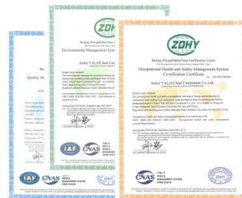
ISO 9001:2015, ISO14001 and OHSAS18001