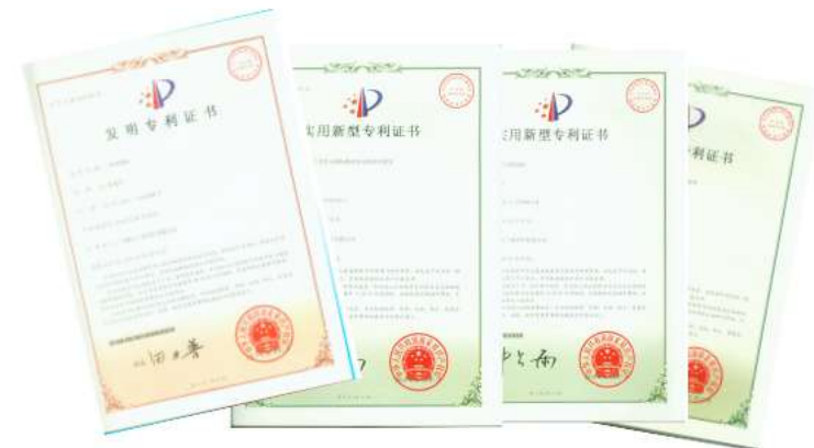
Over 36 Inventions and Patents

With over 29 years of experiences in mechanical seal industry, YALAN has got 36 patents and a lot of other certificates and honors. YALAN's design department has the full ability to design custom mechanical seals according to different special requirements from our clients. Beside for being certificated with ISO 9001:2015, ISO14001 and OHSAS18001, YALAN Seals is also one of the 200 companies in China which have the national industrial production permission for mechanical seals. The production center had been audit and certificated by SGS and BV as well. YALAN Seals was awarded by Manufacturing Excellence & Innovation Awards 2019 as Outstanding Enterprise.