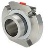
Spring Push Seals