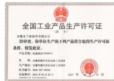
National Industrial Production Permission for Mechanical Seals